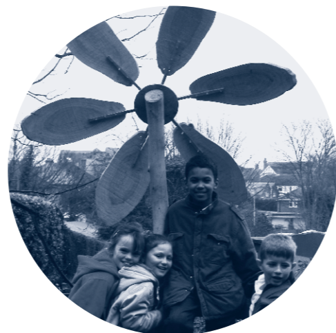
Sidley students with one of their wood sculptures

On 7 July 2006, the Pavilion hosted the major end of year event bringing together all the schools in