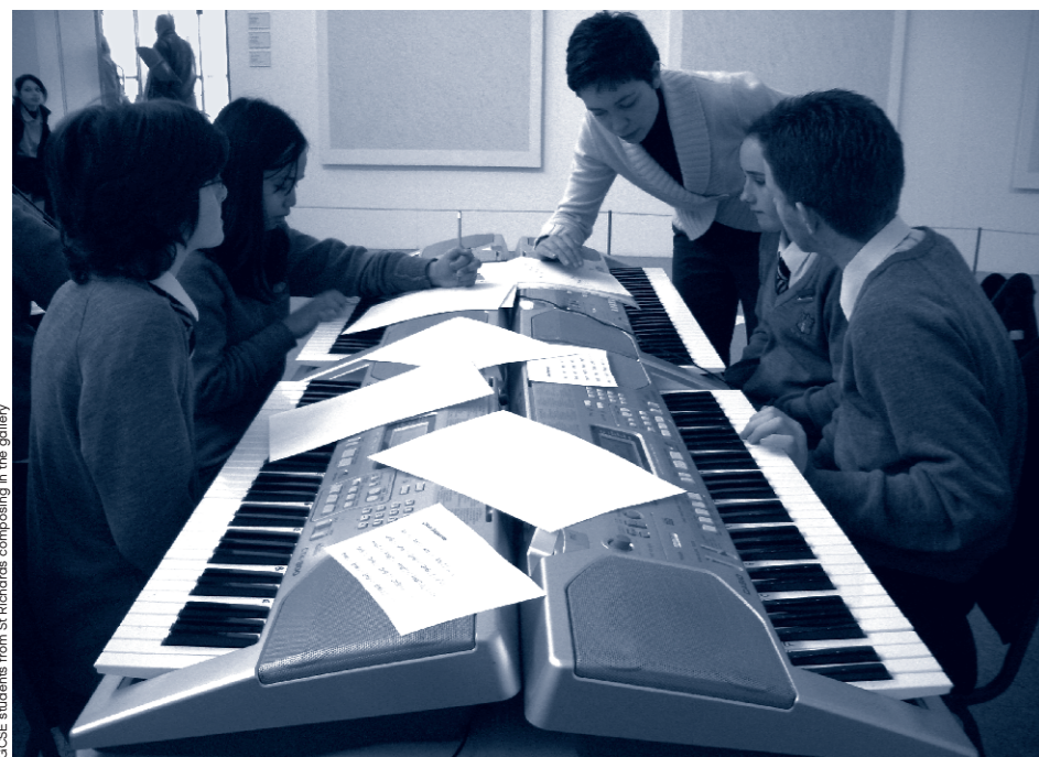
GCSE students from St Richards composing in the gallery